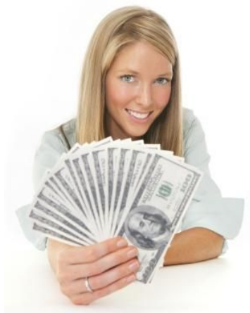
Dave's girlfriend spends all his money.

James nunca escucha los Beatles – James never listens to the Beatles.