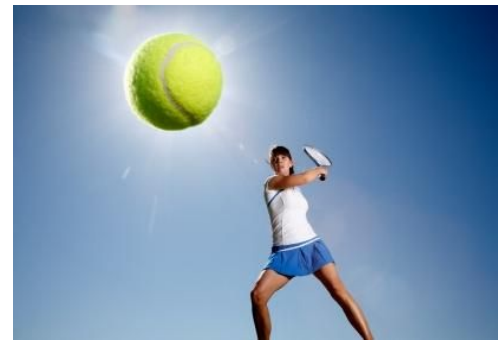
She's playing tennis.