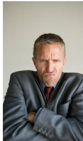
My boss was very angry.