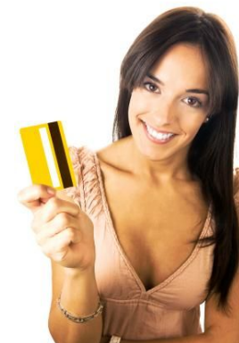
I'm going to buy something