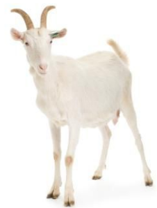
Dave eats goats cheese